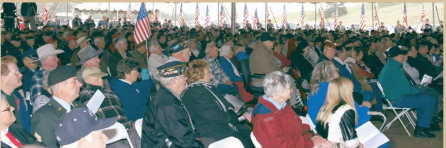
Veterans from all branches of service were among the more than 1,000 people who attended.