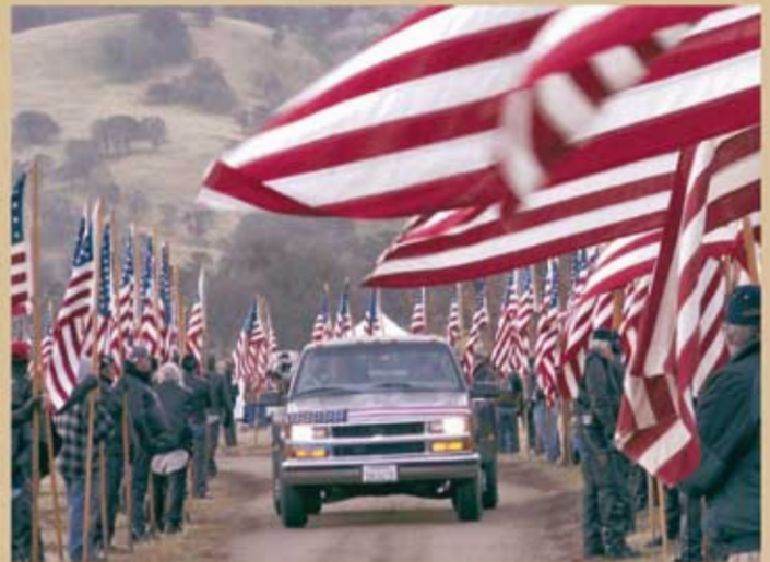
American flags held by members of the Patriot Guard Riders lined the entrance to the site.

"These 500 acres have been part of Tejon Ranch for more than 165 years," Stine remarked. "We are proud and honored that they are going to be used for such an important and noble purpose: to serve as the final resting place for those who have protected our freedoms and served a great and grateful nation. I can't think of any better use for this magnificent piece of land."