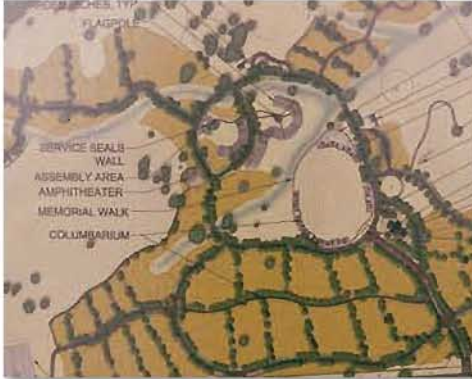
Phase One plans of Bakersfield National Cemetery.