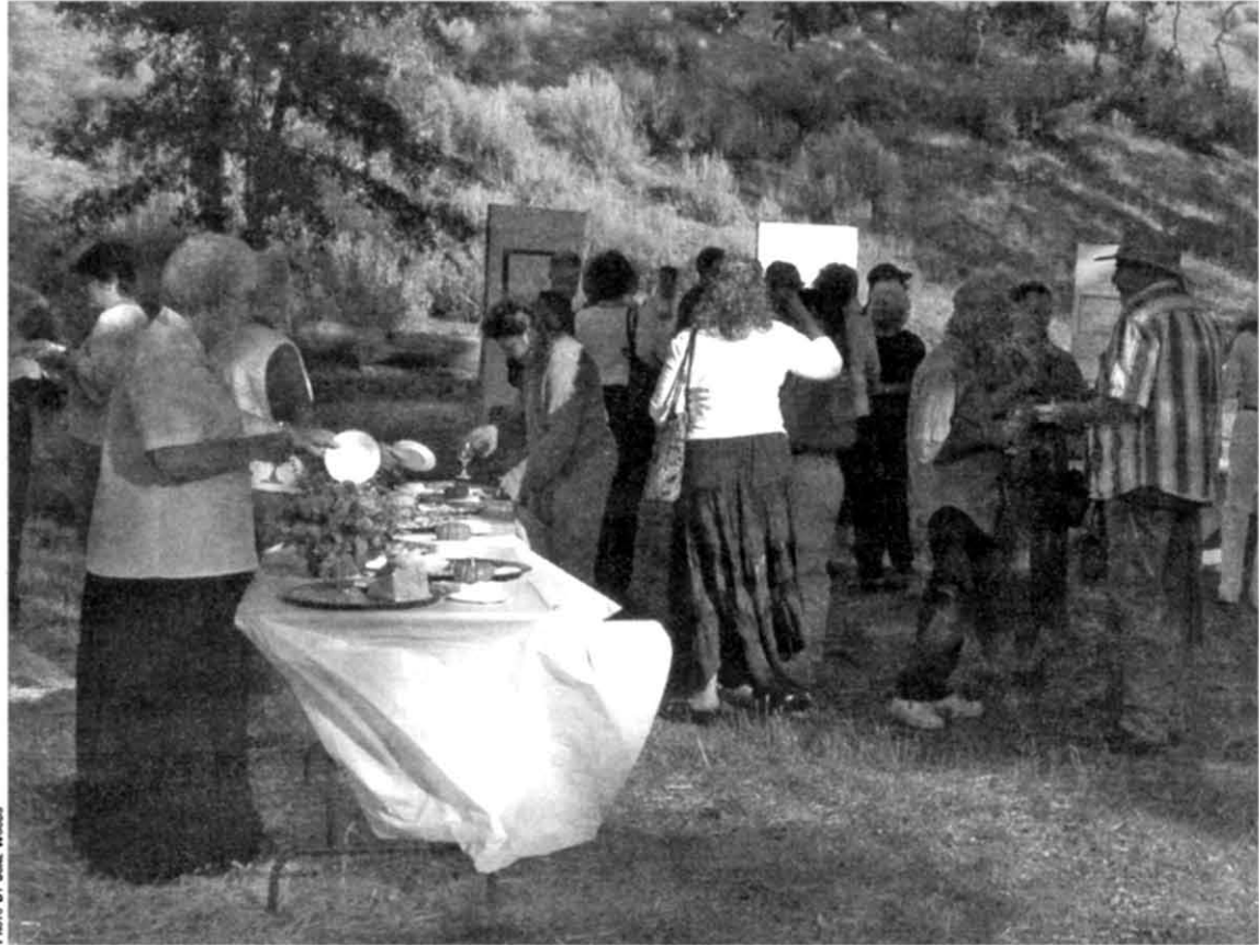
Guests enjoyed a selection of quality cheeses at the event.

They have also applied for a couple of grants and received one from the Kern County Community Foundation. We're always trying to