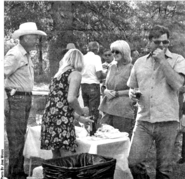
The Tejon Ranch label was one of the those served at Shelter on the Hill's fundraiser.

The group is in the process of designing the building, and guests at the weekend event were able to