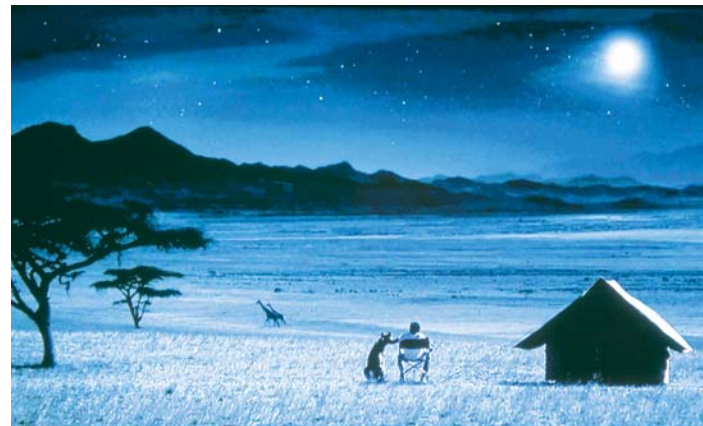
Tejon Ranch doubles as the African plain for Coca Cola’s 2010 Super Bowl commercial.

Most recently, the Ranch doubled as the African plain for one of Coca Cola’s Super Bowl commercials. The ad featured a man sleep walking past wild animals and other perils in search of a bottle of Coke. It’s not the first time Tejon Ranch has been featured in the Super Bowl. The