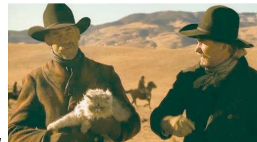
EDS’s “Cat Herders” commercial is a Super Bowl ad favorite.

For more information on filming on Tejon Ranch, visit www.TejonFilm.com