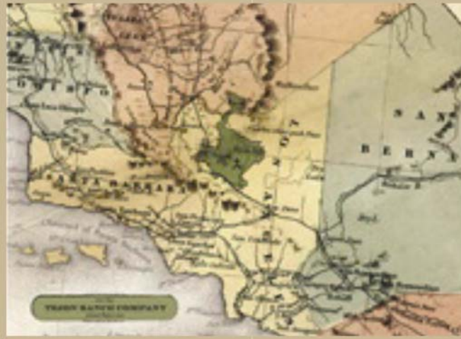
Tejon Ranch 2005 Annual Report

Tejon Ranch Company won several awards for its 2005 Annual Report in the 14th American Business Communicators Annual Report Competition, including a First Place Award for Best Photography/Illustration. The Annual Report also received Outstanding Achievement recognitions for Overall Excellence, Cover Design and Narrative Presentation. Companies from all over the country enter their annual reports in the competition, including such well-known